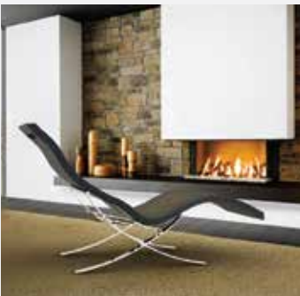
S 120 - INDOOR