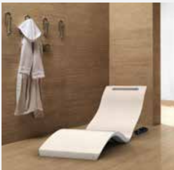
HYBRIDA/80 AVAILABLE FOR ALL THE MODELS