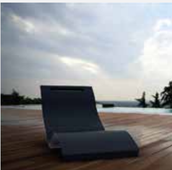
S 100 - GROUND