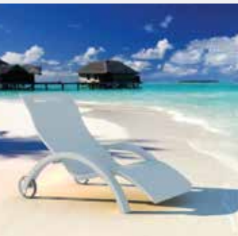
S 110 - OUTDOOR